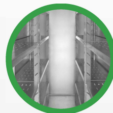
INTERNAL DETAIL OPTIONAL SHELVEING