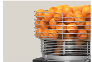
Basket in two sizes

The machine includes a 20 lbs capacity basket as standard equipment. In those cases when an increase in the juicer's autonomy is required, there is an optional basket with load capacity of up to 35 lbs of fruit.