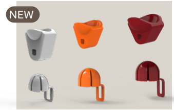
Juice extraction kits

A system developed by Zummo to assemble and disassemble the balls of the kit in just one movement.