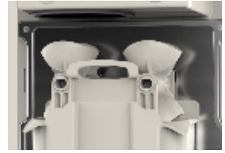
EQS and EVS Advanced

With that intuitive system, the EVS squeezing kit is grouped into a single block minimising the number of parts. Easily assemble and disassemble the squeezing kit in one easy movement. Save time and turn it into profit.